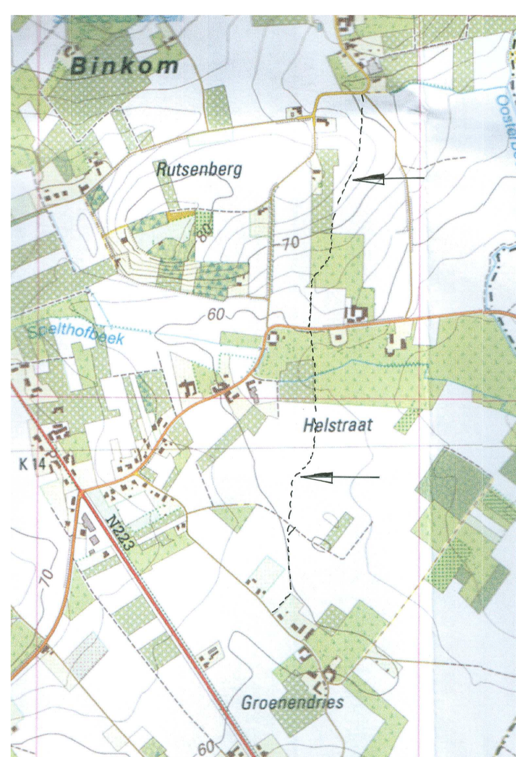
Uittreksel Stafkaart Schaal: 1/10.000